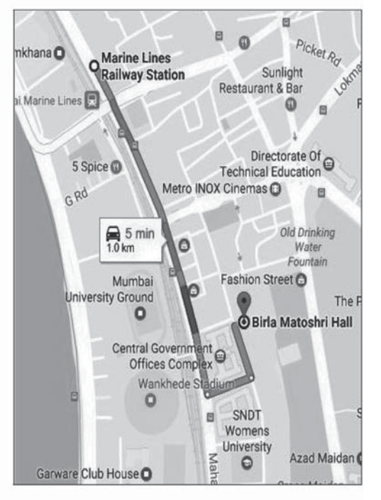
Distance from Marine Line Railway Station: 1 km