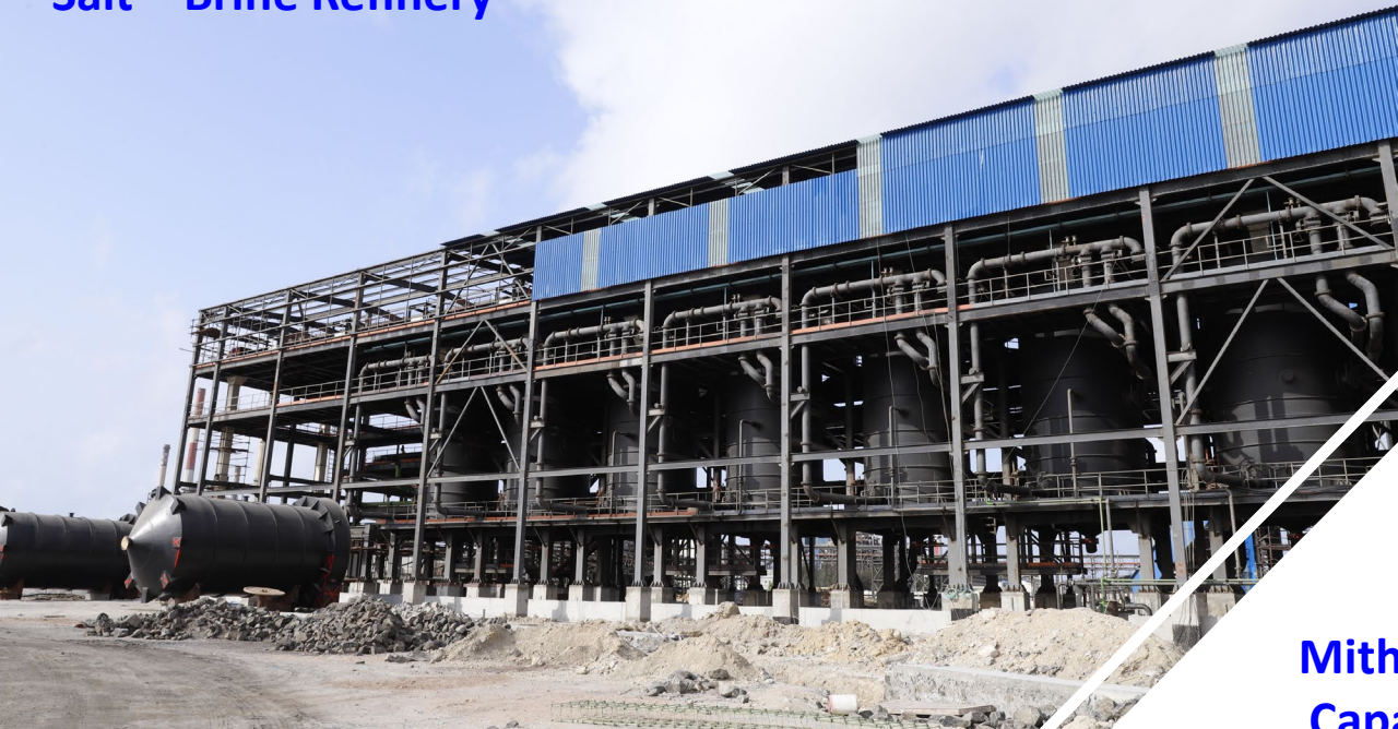
Salt – Brine Refinery